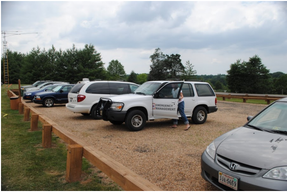
Figure 1: Sara Arrives at Field Day.